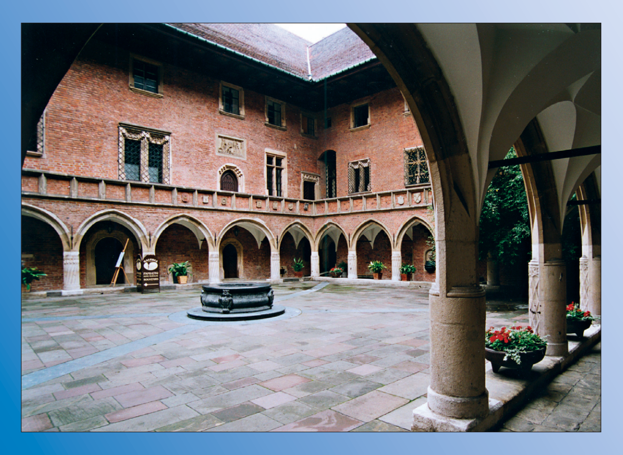
Collegium Maius of the Jagiellonian University

We look forward to welcoming you to Kraków in August 2014!