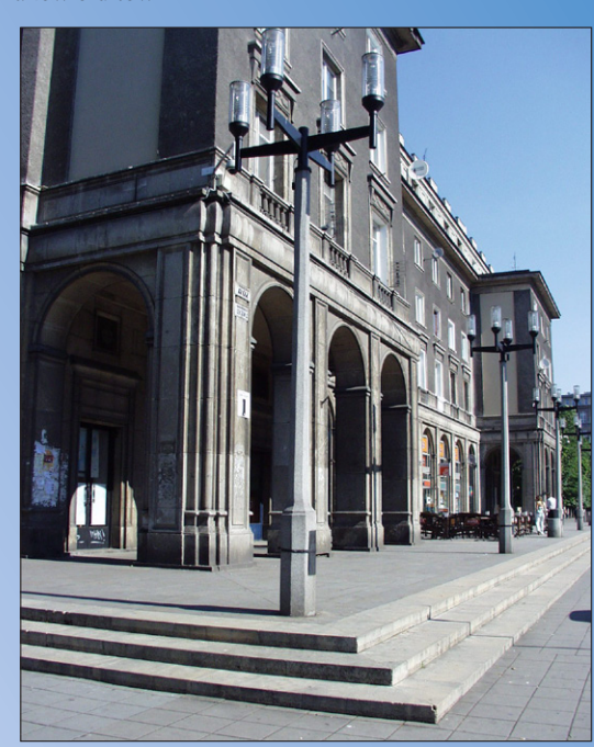
Nowa Huta district in Kraków

Nowa Huta district : the former socialist town and the steelworks; walking/bus tour, duration: 3 hours; minimum number of participants: 20 persons