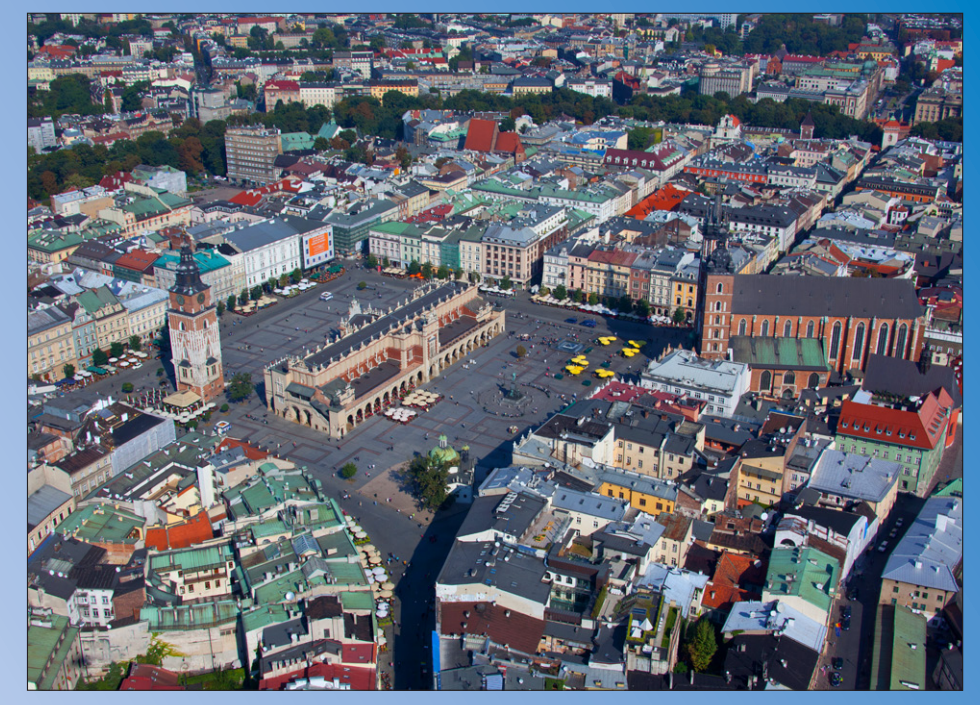
Kraków old town

Kraków old town with the royal castle and the cathedral on Wawel hill (a UNESCO World Heritage Site since 1978) and Kazimierz, the historical Jewish district of Kraków; a walking tour; duration: 4 hours; minimum number of participants: 12 persons