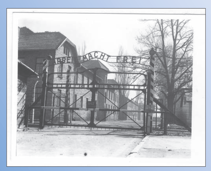
Auschwitz-Birkenau Museum in Oświęcim

Auschwitz-Birkenau Museum: German Nazi Concentration and Extermination Camp (1940-1945), located near Oświęcim, about 60 km west of Kraków, and Wadowice, a town about 40 km south-west of Kraków with the museum of Pope John Paul II, minimum number of participants: 20 persons, maximum number of participants: 30 persons