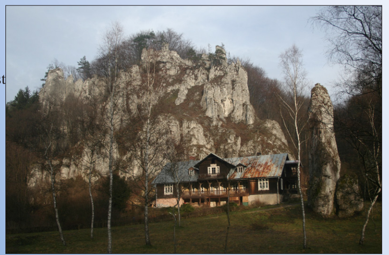
Ojców National Park

Ojców National Park: the smallest Polish national park (1890 ha), established in 1956 to protect the most beautiful and environmentally valuable area of the Kraków-Czestochowa Upland with karst landscape, e.g. numerous caves with remains of Paleolithic settlements, 60 m-deep canyons, isolated rocks; minimum number of participants: 20 persons.