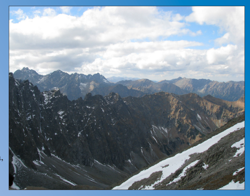
The Tatra Mts.

3 <sup>rd</sup> day: the Slovakian Paradise (karstic phenomena, Demanovska Cave), the Stiavnica Mts. (anthropogenic relief modifications due to historical mining)